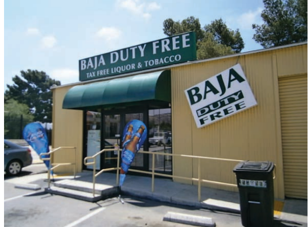
We will meet in front of the Baja Duty Free at the strip mall.