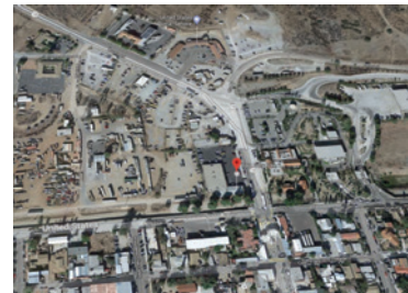
Park in multiple lots on right, one large lot on left.