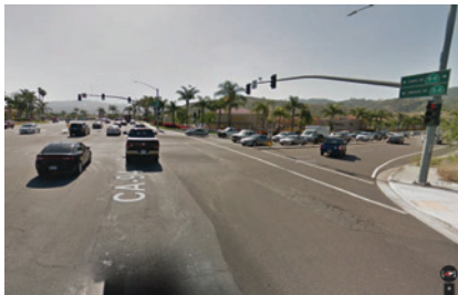
At Jamacha Junction, right onto Campo Road for CA-94.