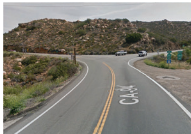
Right on CA-188 South to Tecate, US side.