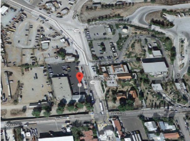
Baja Duty Free is in the strip mall on the right side of the road, directly on US side of the border.